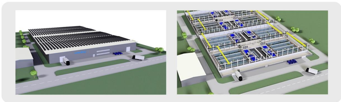
Oceanloop farm with 2,000 tons farming volume per year

The expansion of Oceanloop's farming capacities in Europe to over 2,000 tons of annual volume by 2027 will be done in conjunction with the construction of a dedicated hatchery for the production of shrimp larvae. Internationalization of Oceanloop farms to other import-dependent markets such as the USA, Middle East or Japan is also planned.